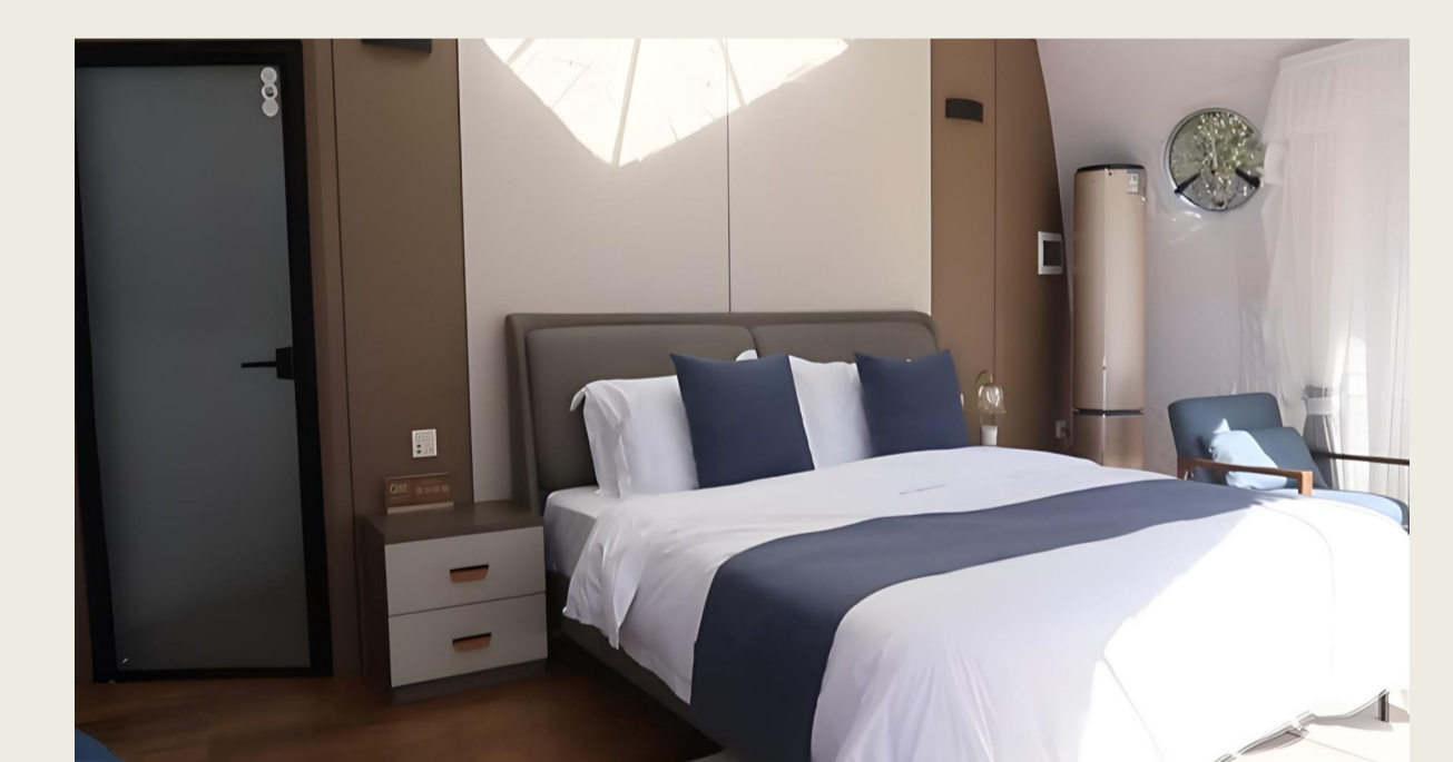
Hard Partition Wall