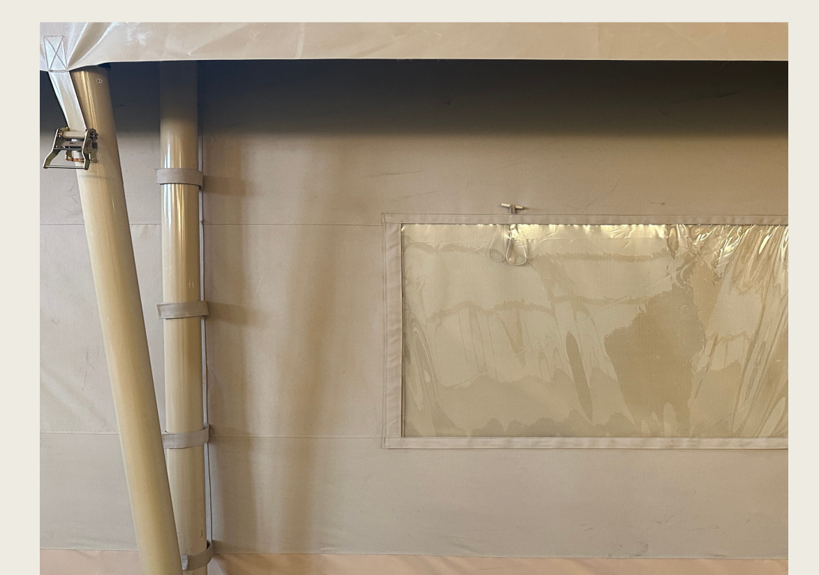
Side Ventilation Window