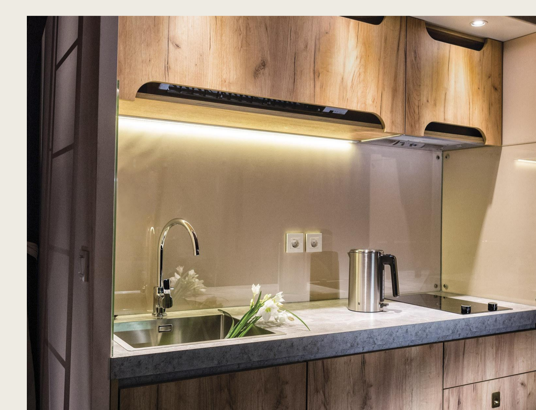
Kitchen And Bathroom System