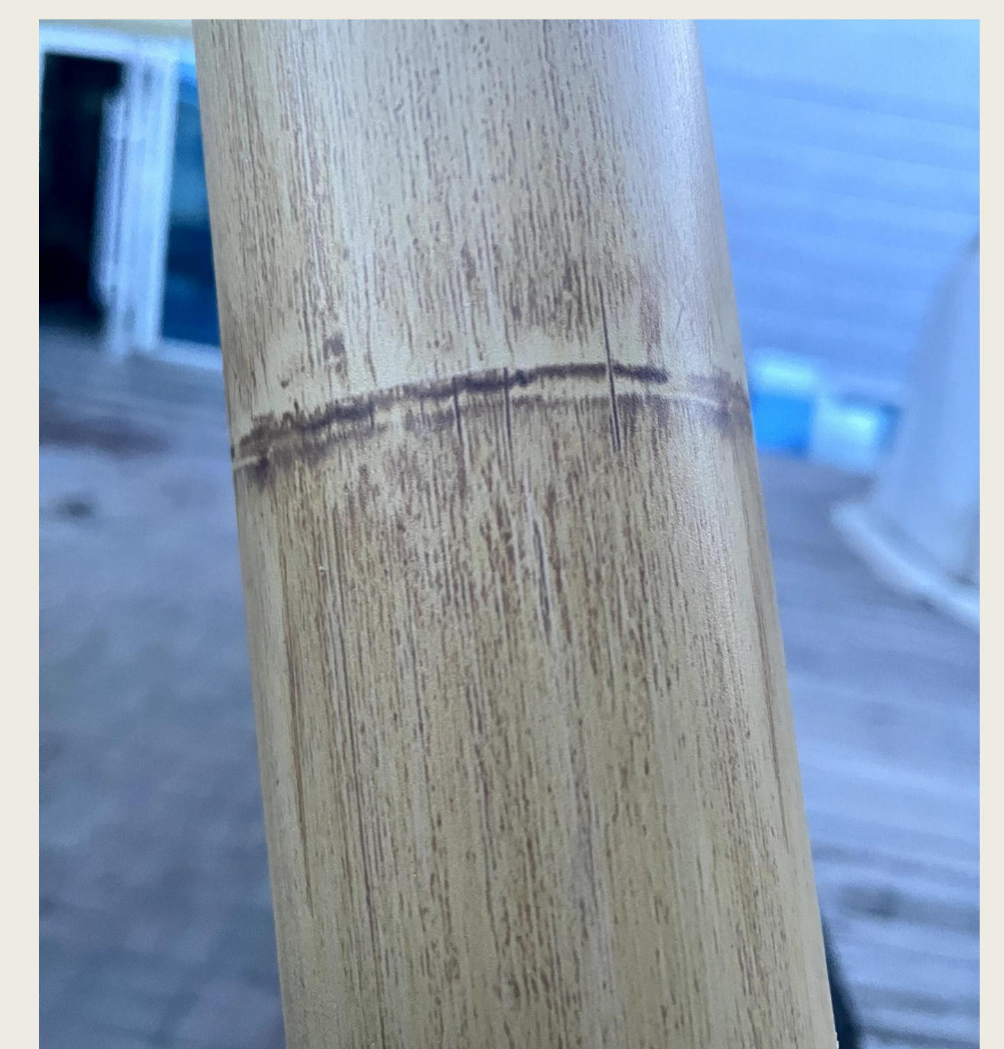
(Bamboo Joint Color) Painted Hot-Dip Galvanized Steel Pipe