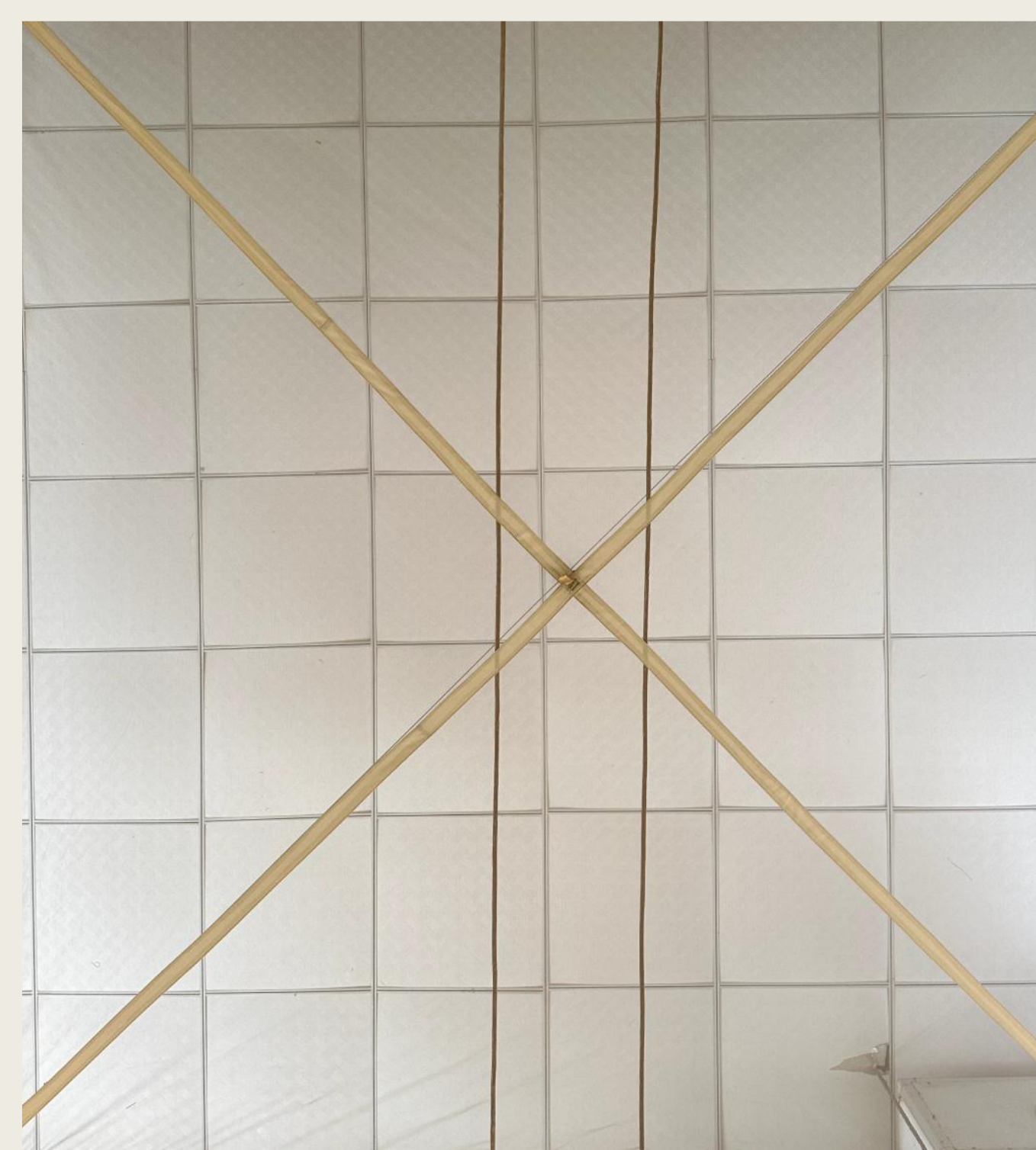
Ventilation Top Skylight