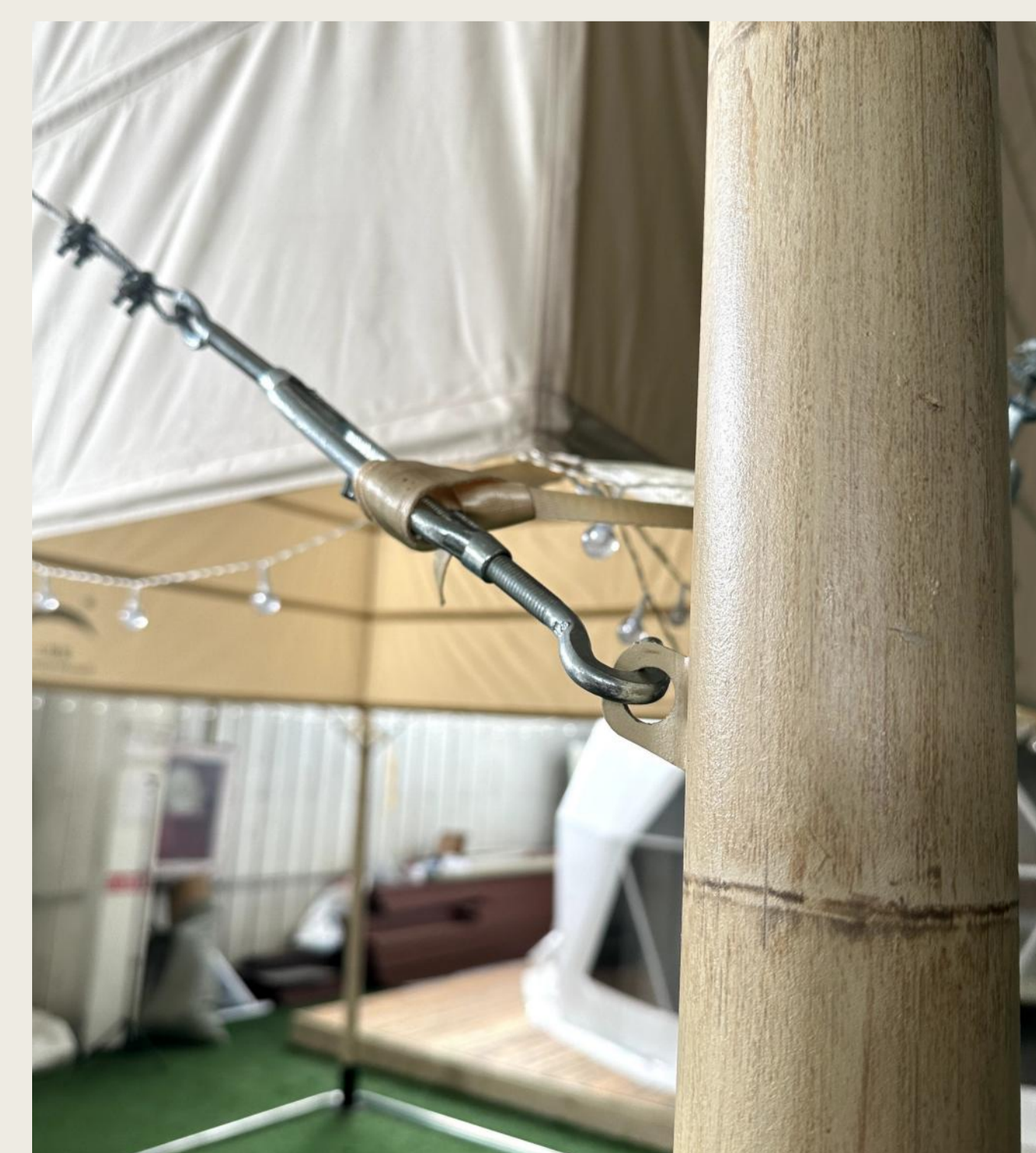
Brace Fixing Point