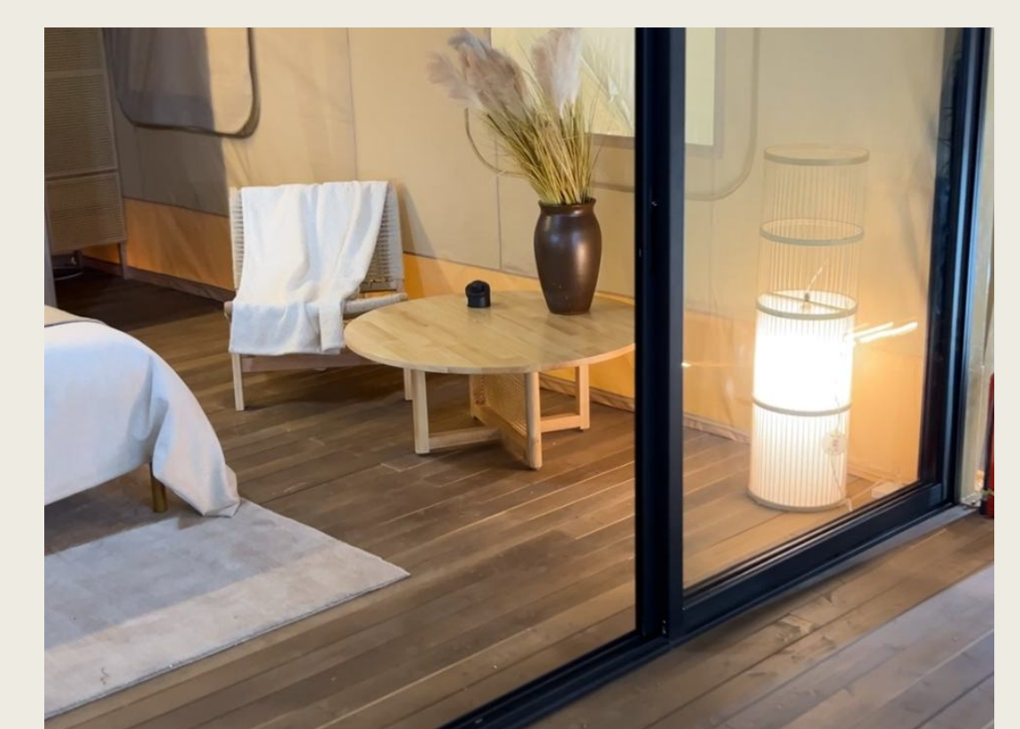
Floor-To-Ceiling Glass Curtain Door