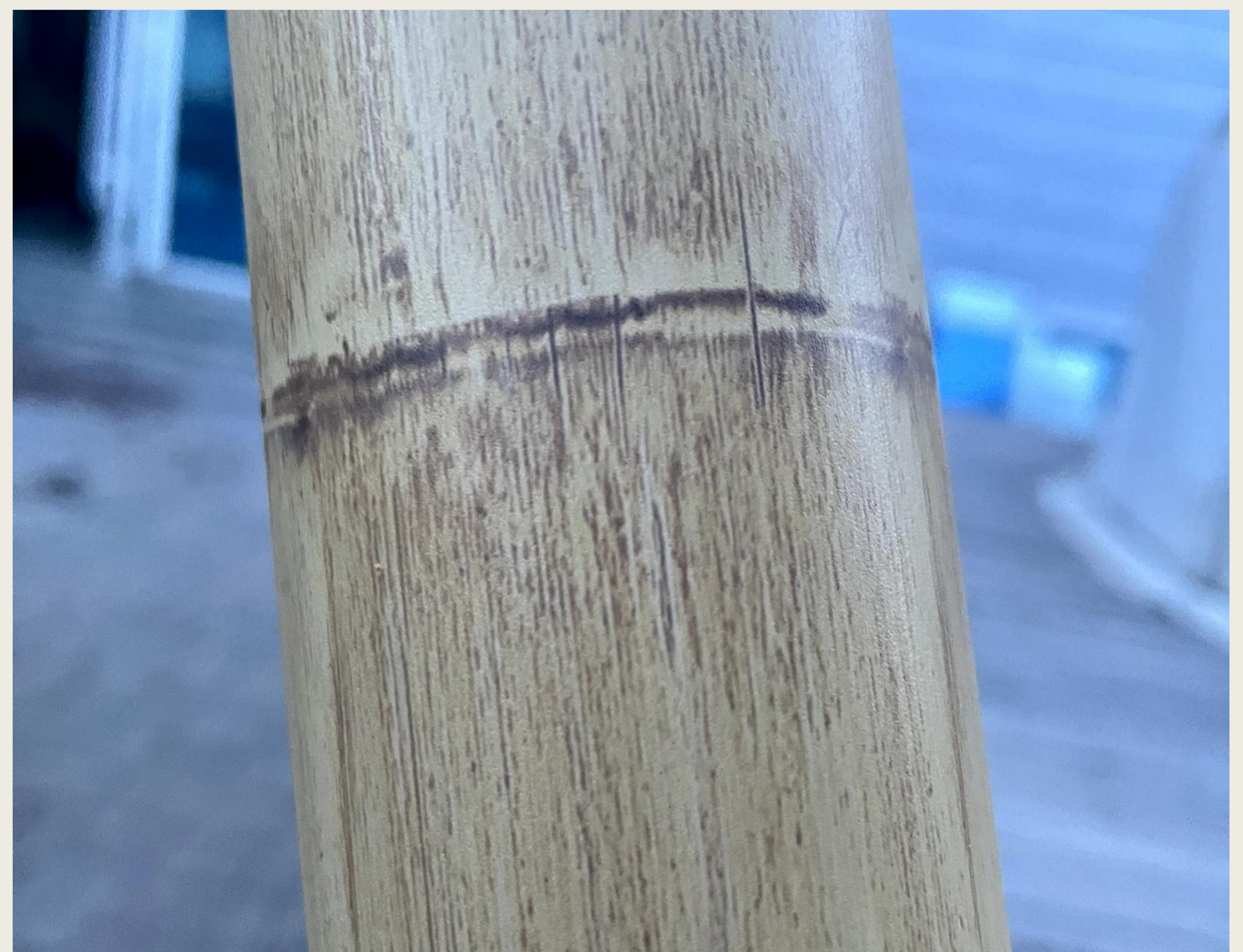
(Bamboo Joint Color) Painted Hot-Dip Galvanized Steel Pipe