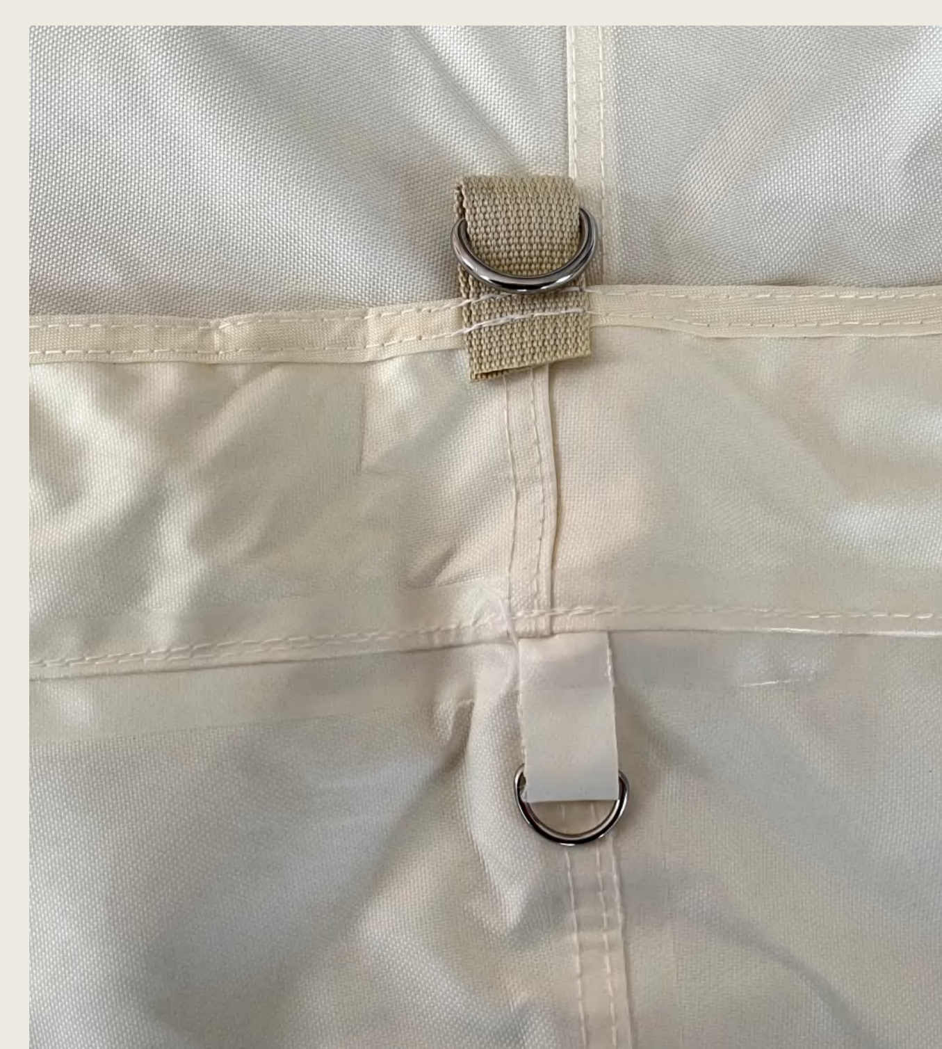
Waterproof Rubber Strip