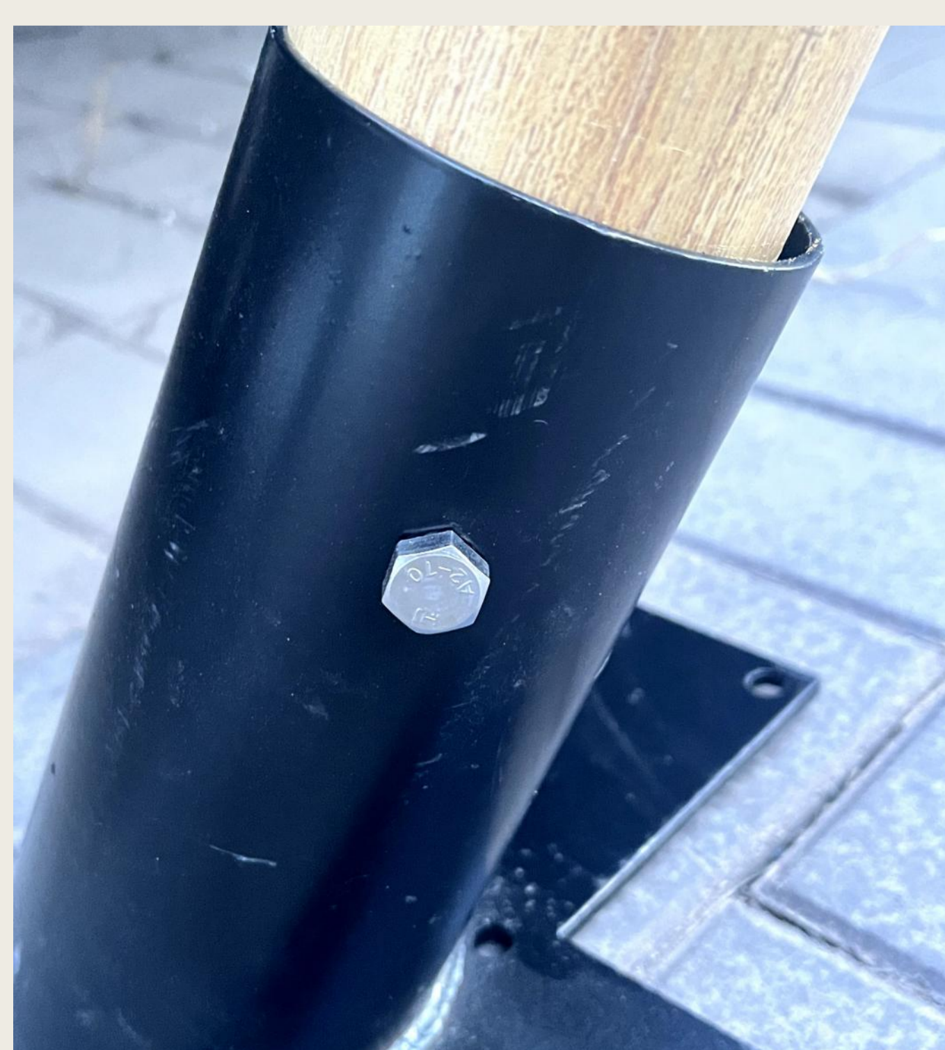
Ground Corner - Ground Peg