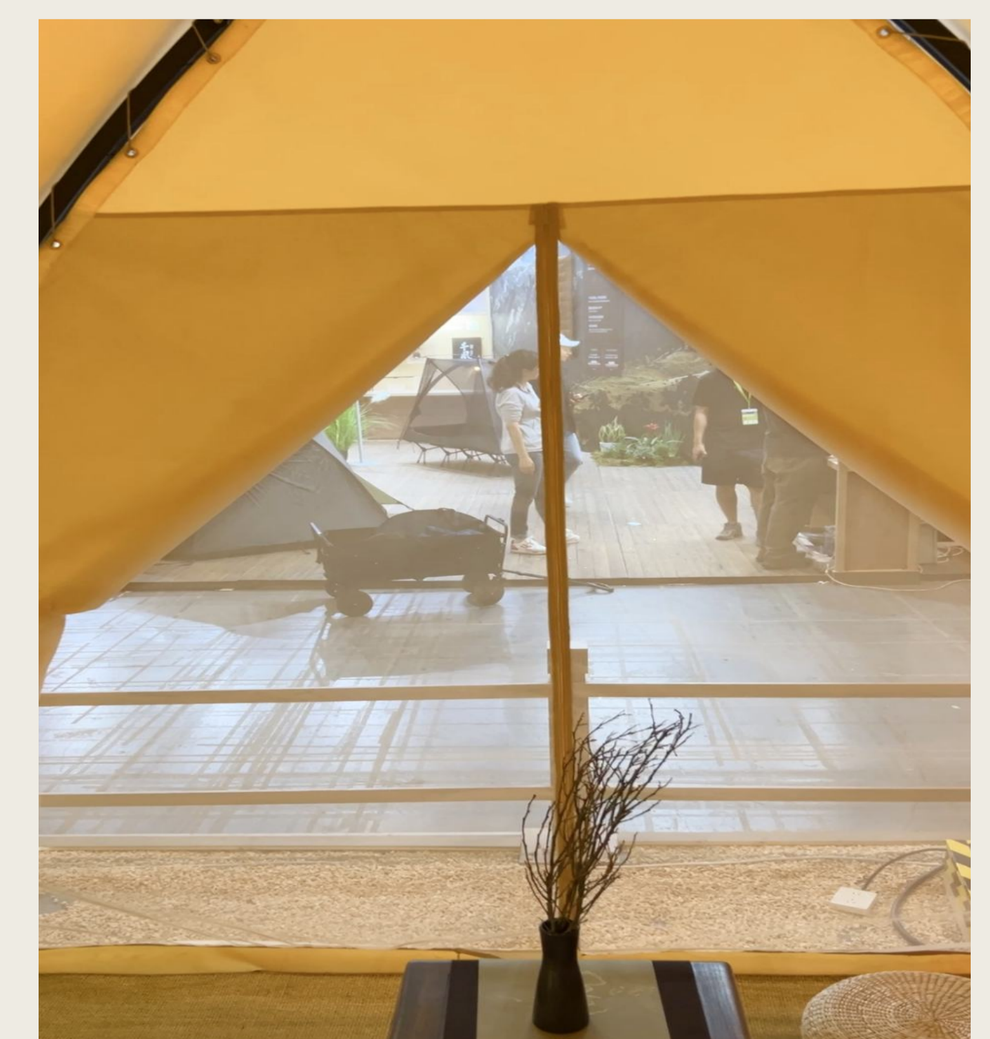
Mesh Screen Door