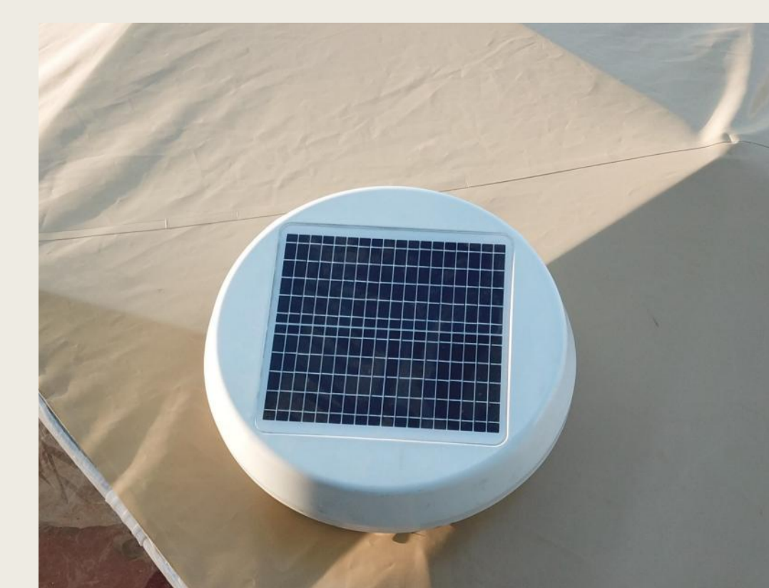
Solar-Powered Exhaust Fan