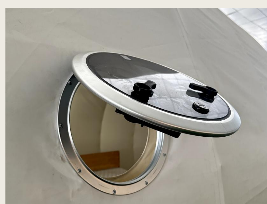
Circular Arched Window