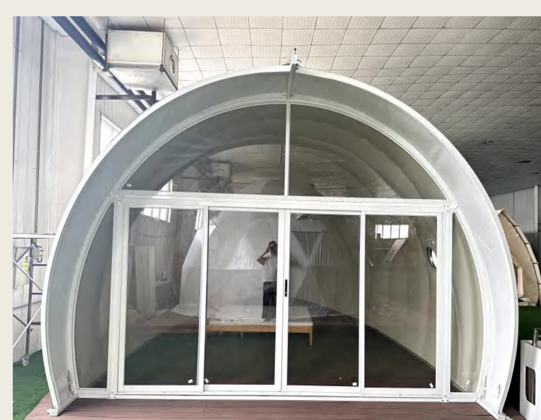
Thermal Break Aluminum Glass Curtain Wall